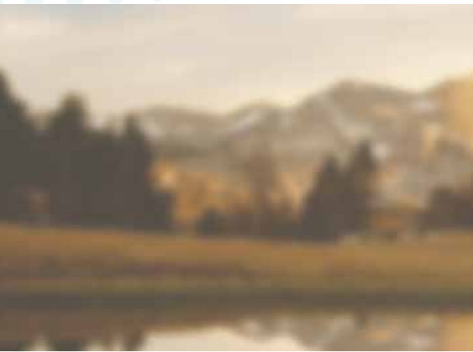
Simulated image with cataracts