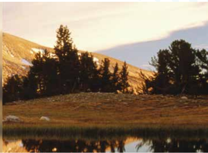
Image without cataracts